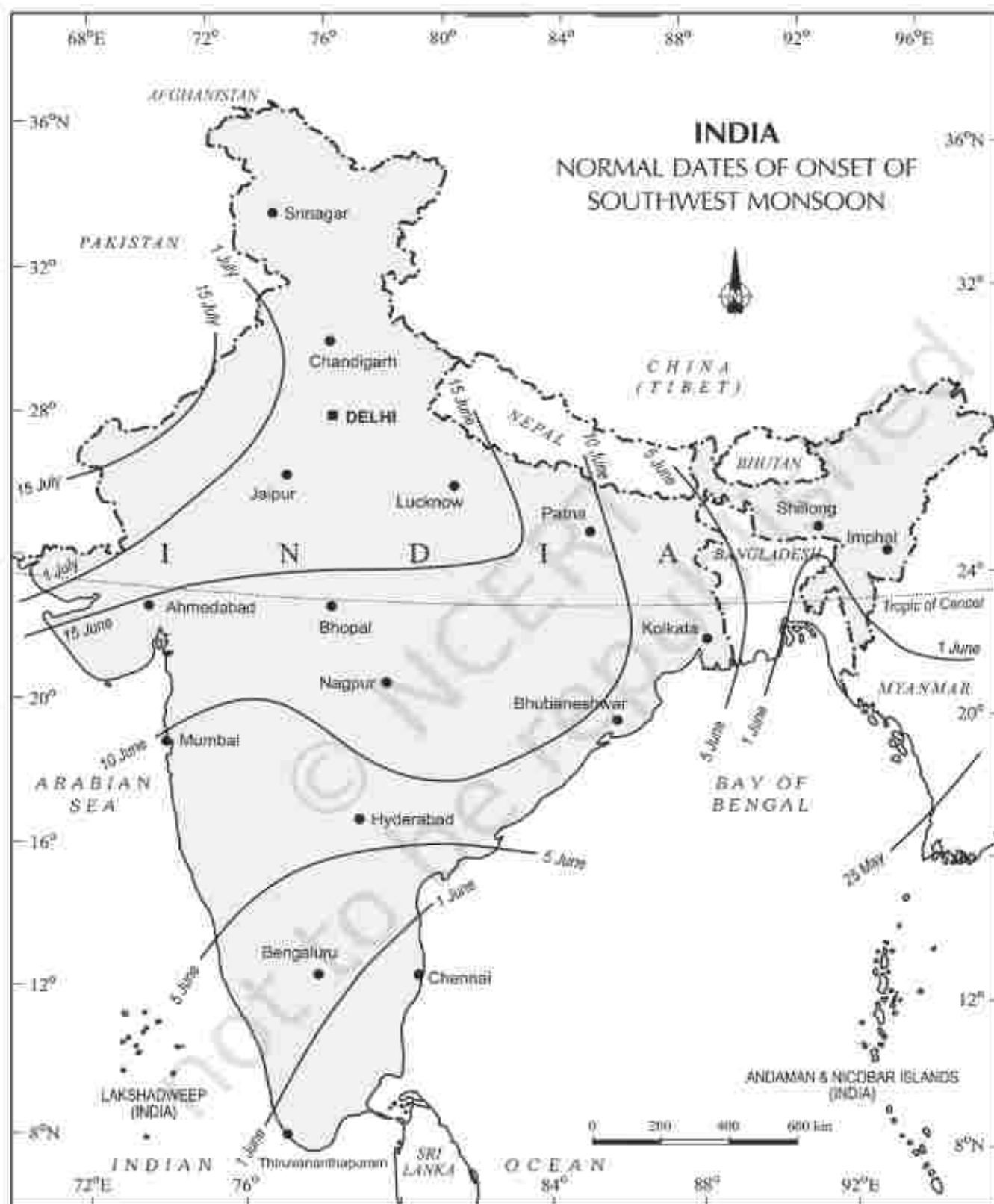
Figure 4.2 : India : Normal Dates of Onset of the Southwest Monsoon