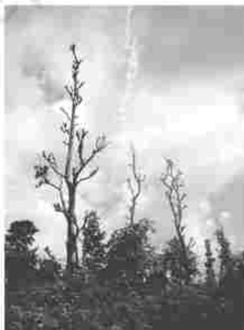
Figure 4.1 : Onset of Monsoon

gets intensely heated. This causes the formation of an intense low pressure in the northwestern part of the subcontinent. Since the pressure in the Indian Ocean in the south of the landmass is high as water gets heated slowly, the low pressure cell attracts the southeast trades across the Equator. These conditions help in the northward shift in the position of the ITCZ. The southwest monsoon may thus, be seen as a continuation of the southeast trades deflected towards the Indian subcontinent after crossing the Equator. These winds cross the Equator between 40^{\circ} E and 60^{\circ} E longitudes.